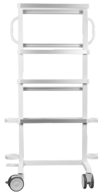
Single Cart shown without accessories.

*Cylinders, devices, and accessories not included.